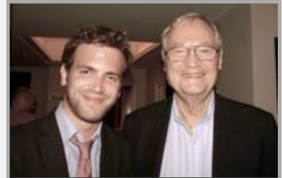
Roger Corman and "Surrogate's" Wolf 19 Photos | View Gallery (June 26, 2009)